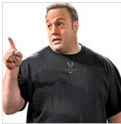
Never Underestimate the Average Joe