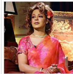
He's Breaking All of Islam's Taboos