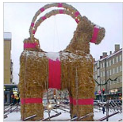
The Lede: Gävle Goat Survives in Sweden